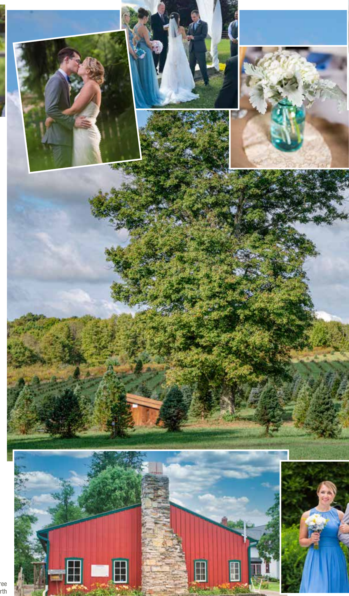
The Christmas Tree Barn looking north

Heritage Farms can arrange catering for your convenience. Our caterers take pride in serving the quality foods you expect, whether for your rehearsal dinner, reception or both. We also offer the option to have full bar service for both your rehearsal and reception dinners. Full bar service with bar tender may include your own selection of non-alcoholic beverages, wines, mixed drinks and beer if you desire.