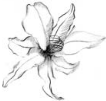
Pinched: The end of the petals and sepals look as though they have been pinched.