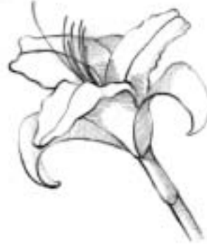
Triangular: Only the sepals curve back toward the scape.