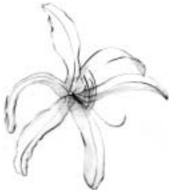
Spider: Long skinny petals and sepals that may be twisted.