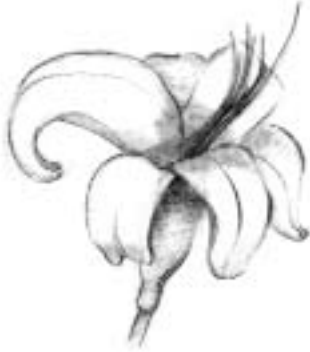
Recurved: Both petal and sepal curve back toward the scape.