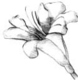
Double: The reproductive parts become an extra set of petals.